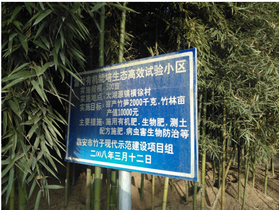
Figure 3: Sign Showing the Adoption of Hazard-Free and Zhejiang Forest Food Production Base Standards

The cooperative not only encourages its own demonstration household farms to display its Hazard-Free Production Standard but also uses the networks of the demonstration households to promote its brands and attract interested farmers